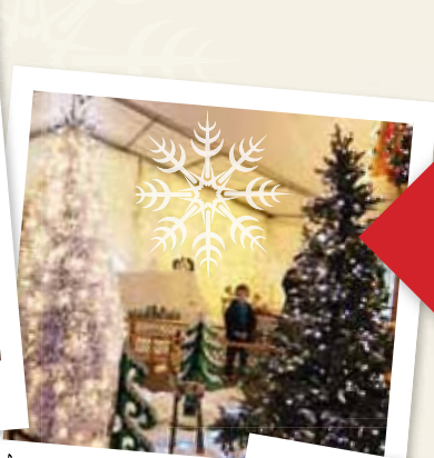
Ice Palace 2012