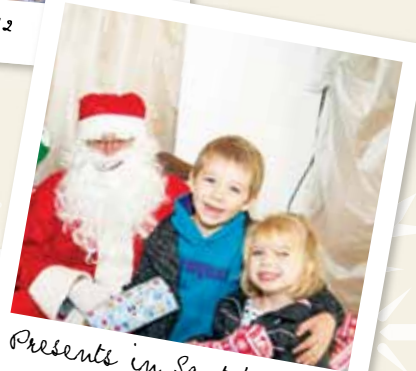
Presents in Santa's Grotto