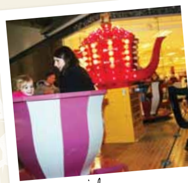
Tea cup ride

As the big day gets closer even more festive fun will be happening at White River Place, as the 12 days of Christmas countdown begins on Friday 13 December.